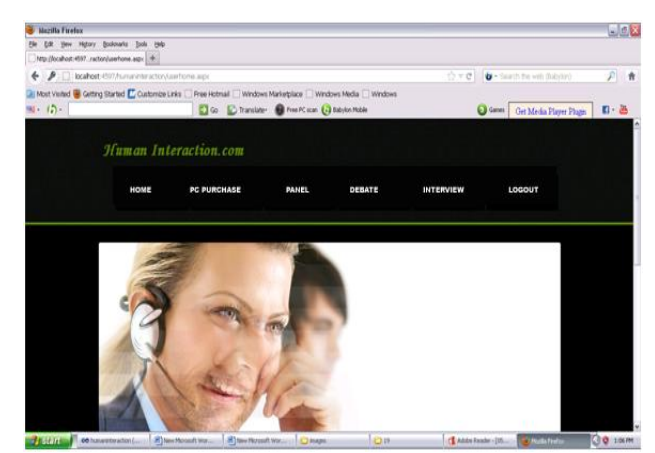
Fig.5.1. Home page